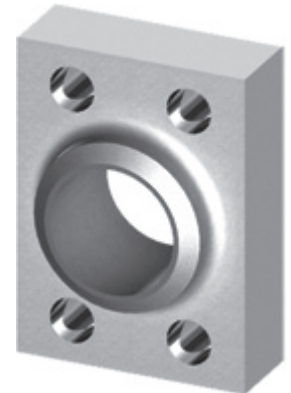
Model 1121 / 1123